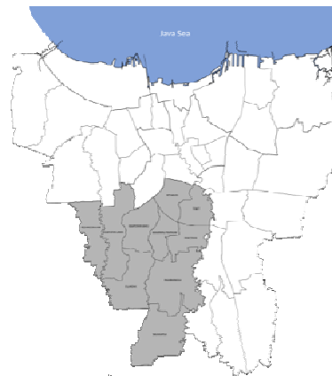
Figure 2. South Jakarta district

The survey was conducted in five sub districts such as Tebet, Pancoran, Mampang Perapatan, Pasar Minggu and Setia Budi (Figure 3). In Tebet sub district, the survey was conducted in Tebet Timur and Tebet Barat village. The survey in Pancoran sub district was conducted in Kalibata village and Pancoran village. The survey in Mampang Perapatan sub district was conducted in Kuningan Barat village. The survey in Pasar Minggu sub district was conducted in East Pejaten and West Pejaten village. The survey in Setia Budi sub district was conducted in Setia Budi village. The survey was administrated for one month in June 2010, to Jakarta middle-class households and generated 137 responses, with response rate of 84 percent.